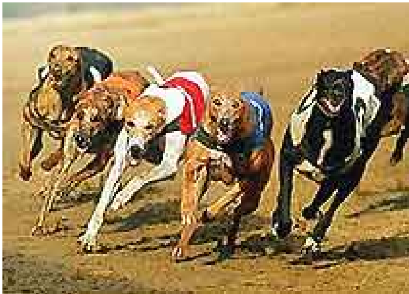
Racing to the GPA-SN Picnic!

It's in the planning stages and will have all of the fun and games, the picnic lunch with greyhounds, family and friends, the contests and booths and the silent auction.